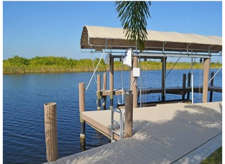
Covered boat lift