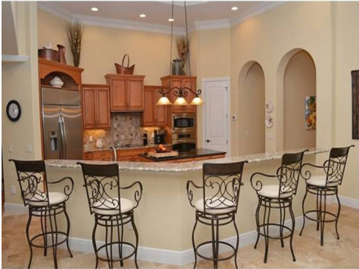
Fully equipped kitchen with breakfast bar