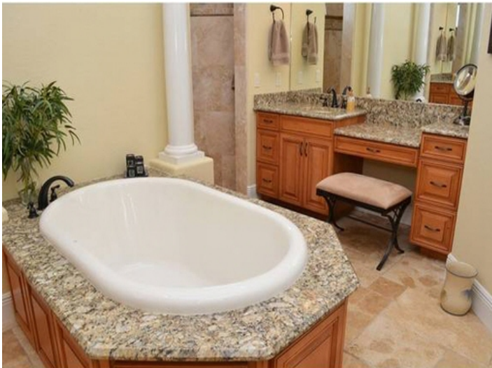
Luxurious bathroom with bath and vanity mirror