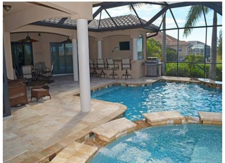
Terrace with pool and waterfall