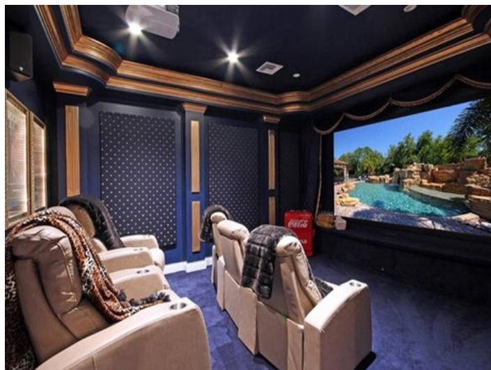
Private cinema room