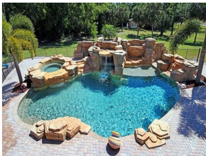
Enchanting Pool on the terrace ☒