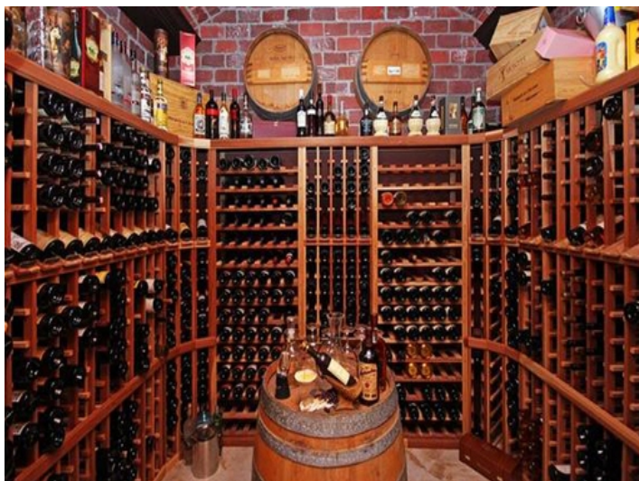
Hard to find wine cellar