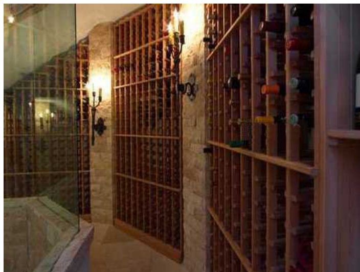
Exclusive wine cellar