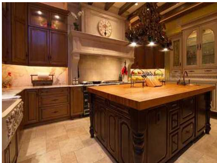
Rustic kitchen with island