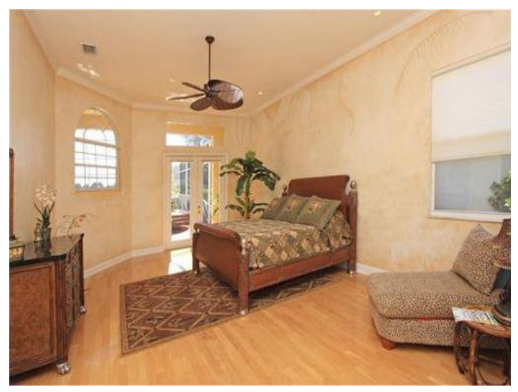
Comfortable bed room