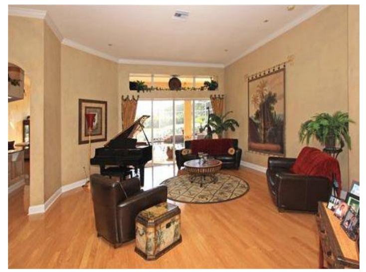
Open and inviting living room