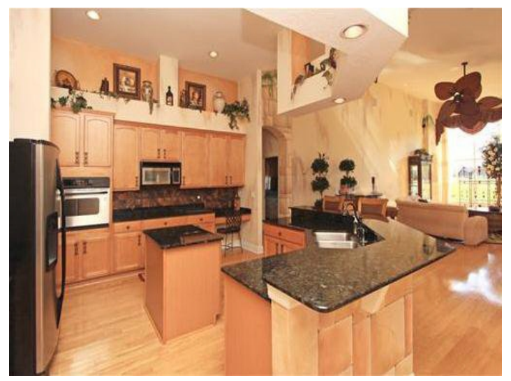
Modern and open kitchen