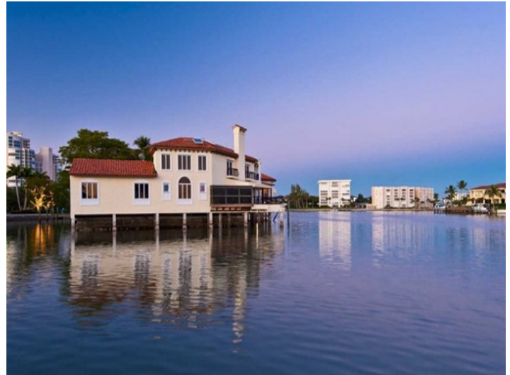
Property view during the day