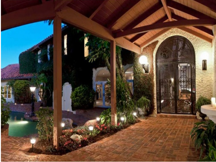
Entrance to the property