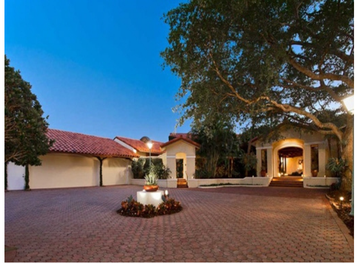
Inside the property, front yard