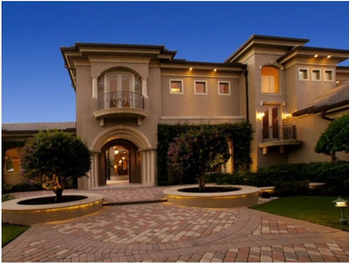
Entrance to the villa