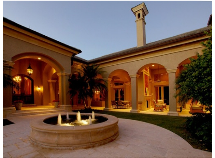
Fountain inside the property