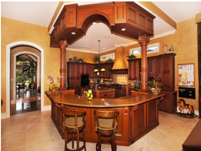
Comfortable kitchen area with bar