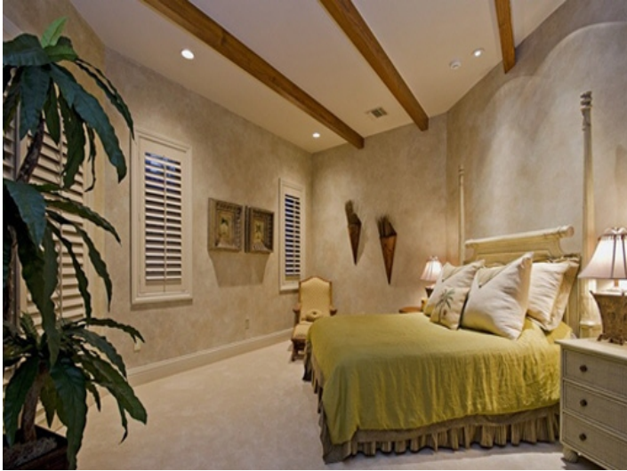
1st floor Master bedroom