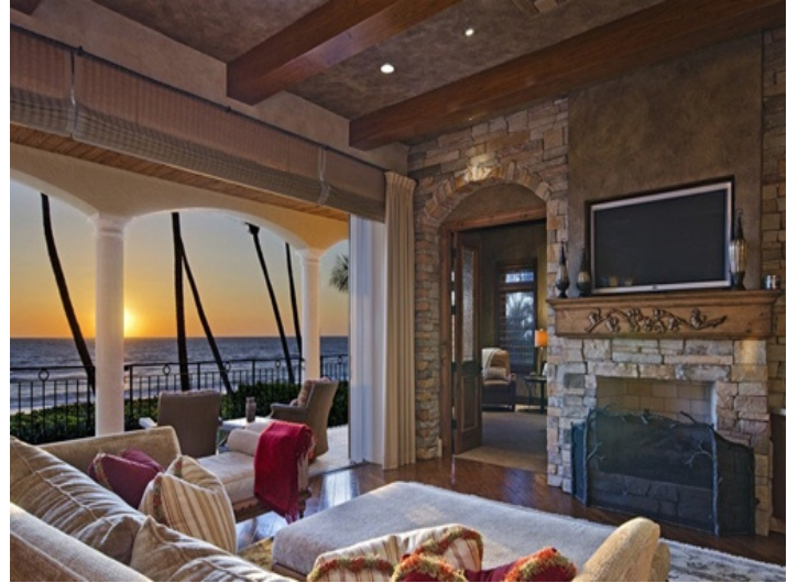
Living area with fireplace and view