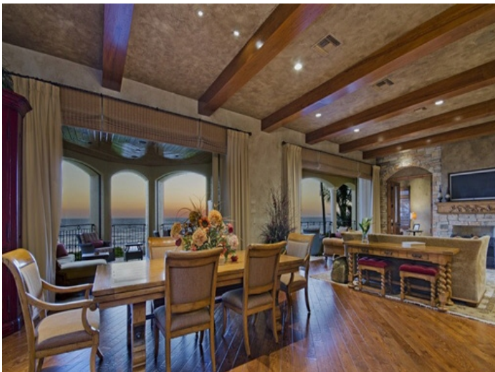
Comfortable dining area