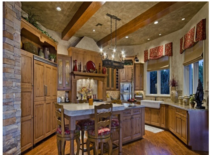
Kitchen with cupboards