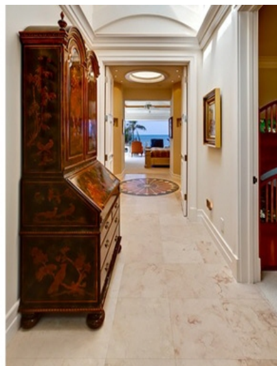
Area after the entrance doors