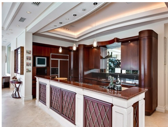
Luxurious and spacious kitchen area