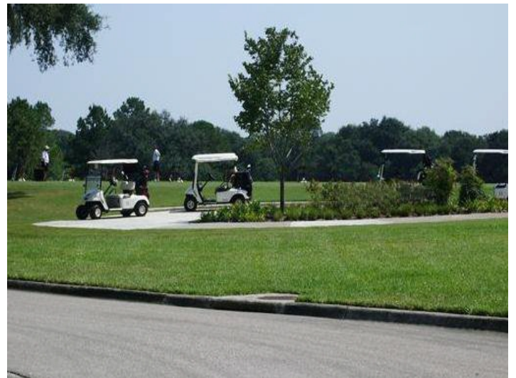
Living next to the golf course

All information is correct to the best of our knowledge. Errors and prior sale excepted. This prospectus is purely for information purposes. Only the notarized deed of sale is legally binding.