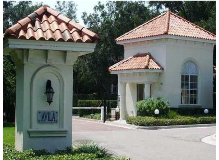
Gateway to community