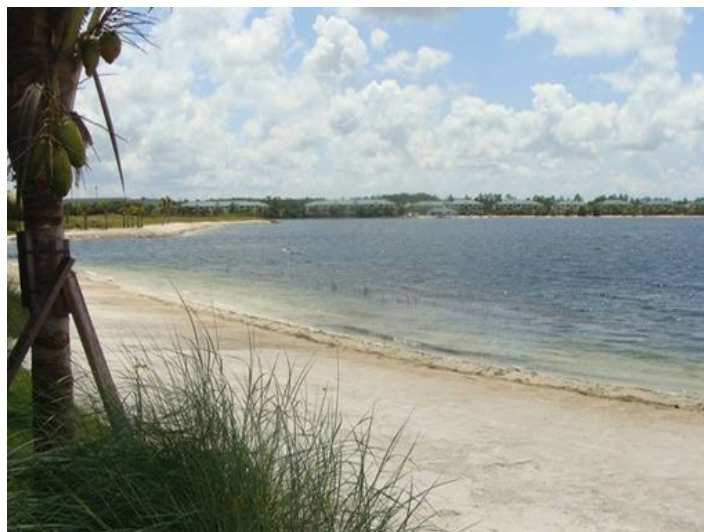
Idyllic views of the surrounding terrain in Fort Myers