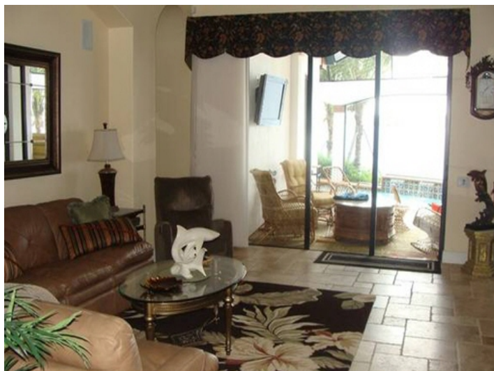
Beautiful living room with terrace and Media Center in Fort Myers