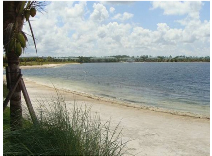
Idyllic views of the surrounding terrain in Fort Myers