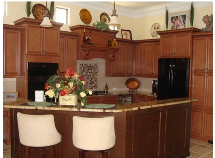
Family kitchen with breakfast bar in Fort Myers