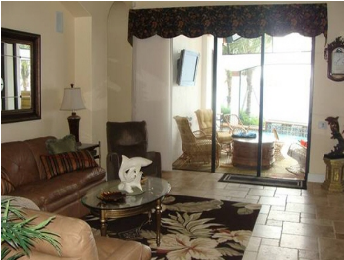
Beautiful living room with terrace and Media Center in Fort Myers