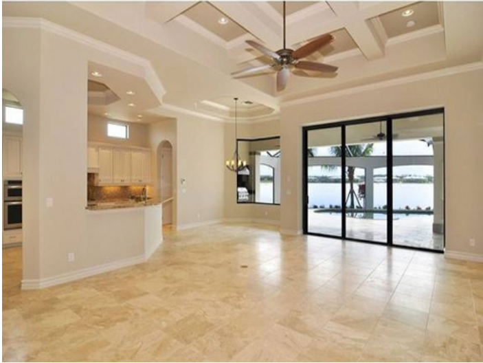
Impressive living space with view to the fully equipped kitchen in Fort