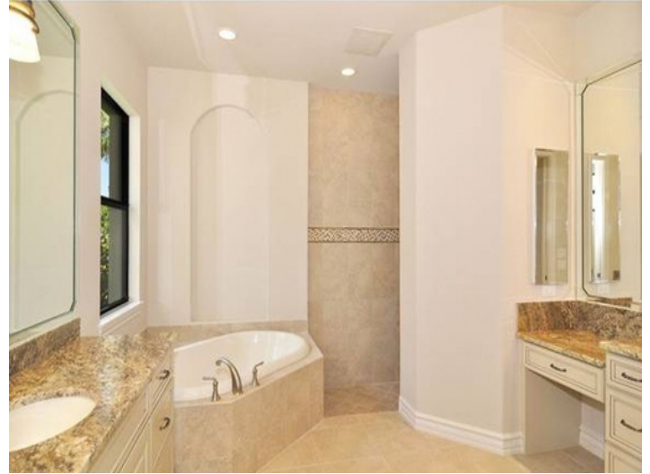
Bathroom with all amenities in Fort Myers