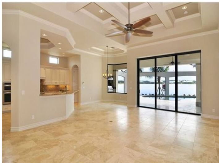
Impressive living space with view to the fully equipped kitchen in Fort