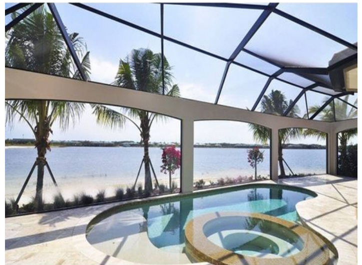
Terrace with pool and summer kitchen in Fort Myers