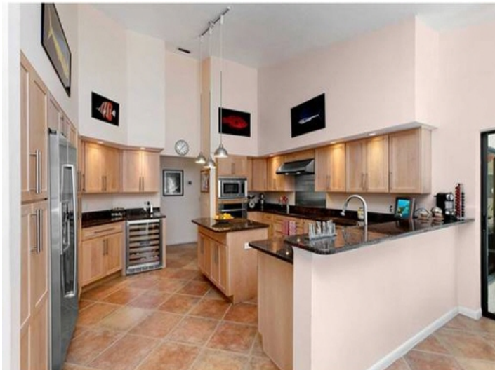
Fully equipped kitchen with breakfast bar