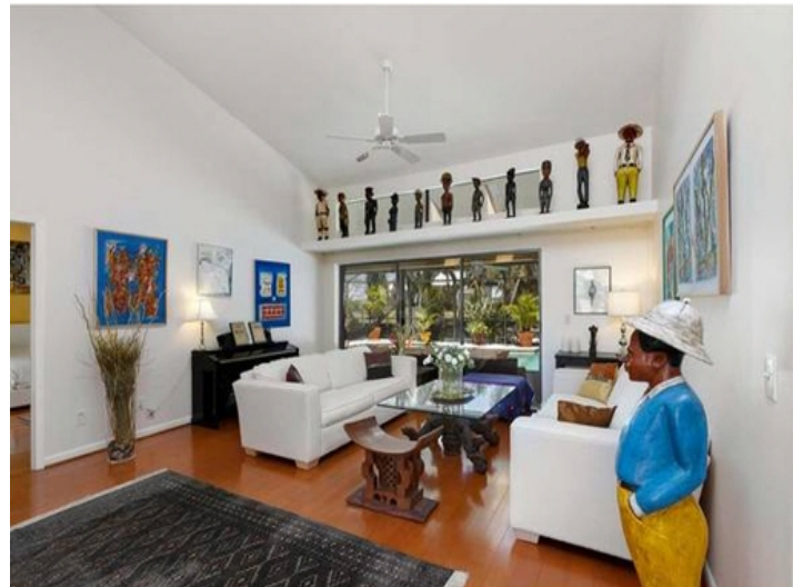
Living room with stylish furnishings