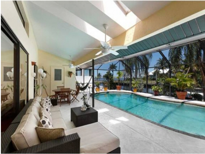
Spacious terrace with mosquito net and pool