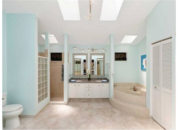
Superb bathroom with shower