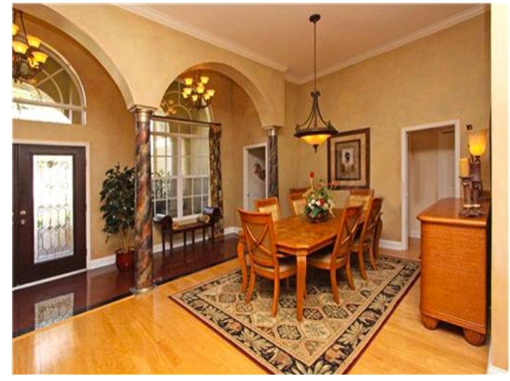
Formal dining room with the parquet floor