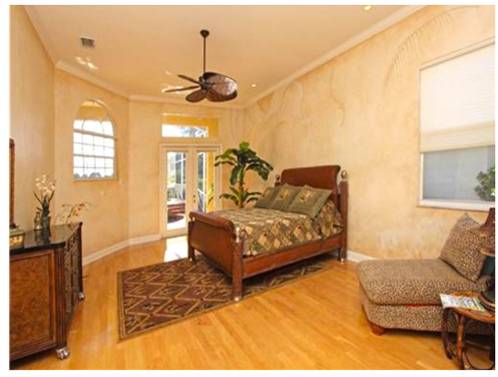
Beautiful and spacious bedroom