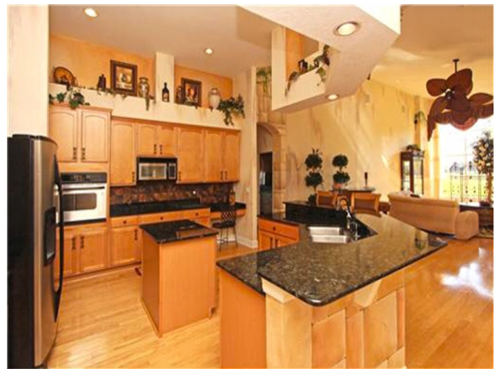
Fully equipped open style kitchen