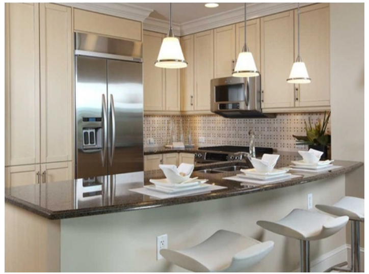
Beautiful breakfast bar