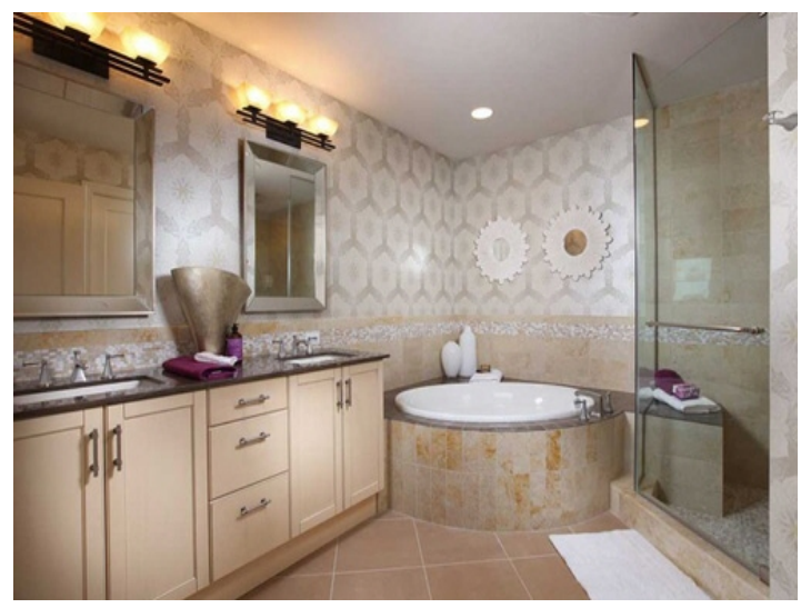
Large, impressive bathroom