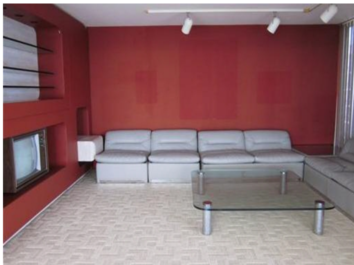
Cozy living room