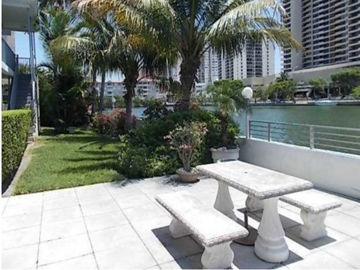
Outdoor area with seating