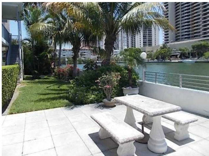
Outdoor area with seating