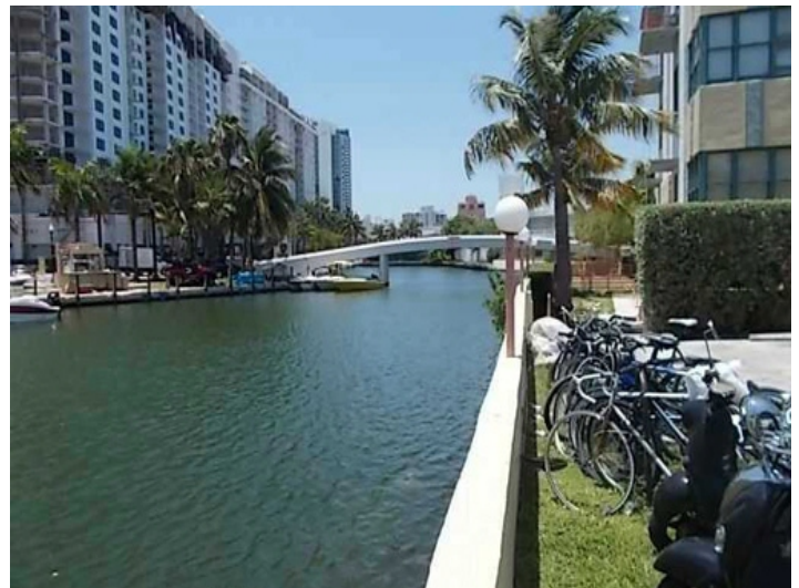
View to the living area