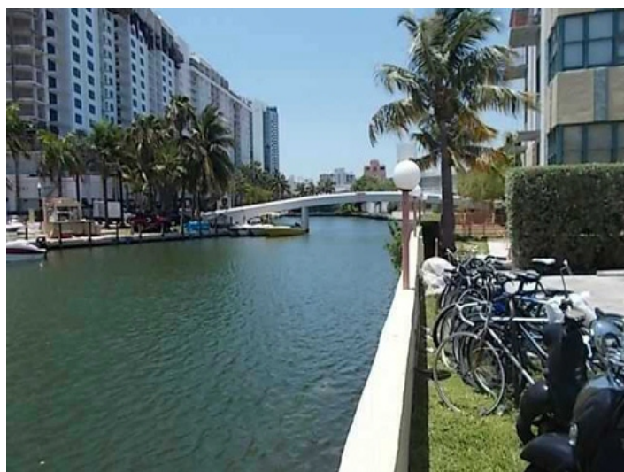
View to the living area