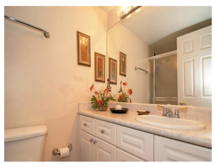
One of the 2 lovely bathrooms