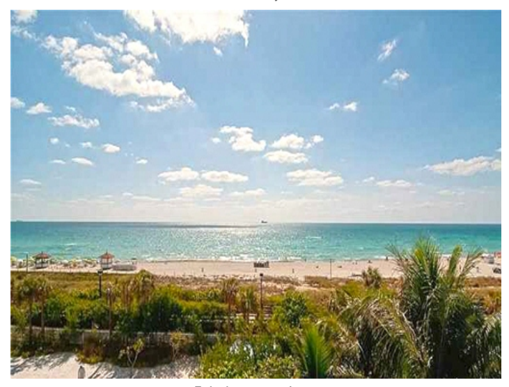
Fabulous sea views