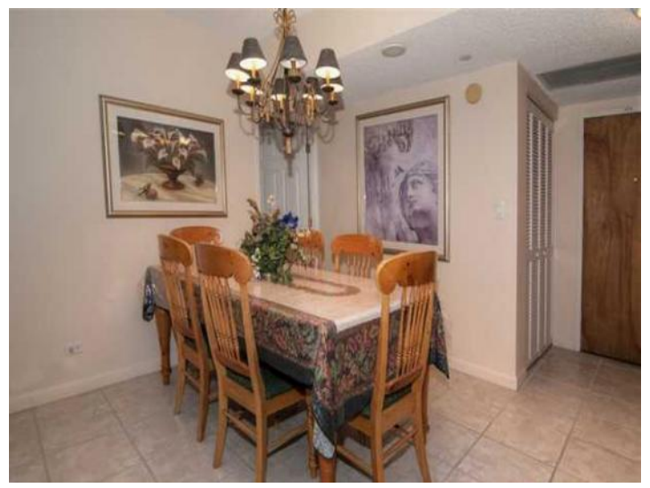
Magnificent dining room