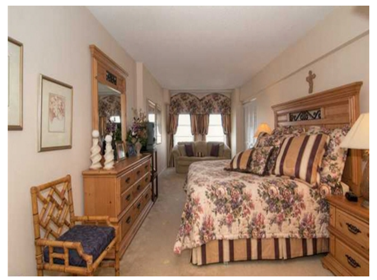
One of the 2 precious bedrooms