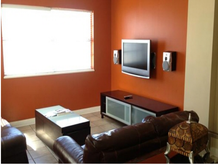
Classy living room