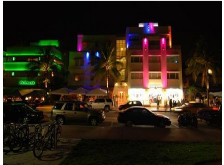
Stunning night view