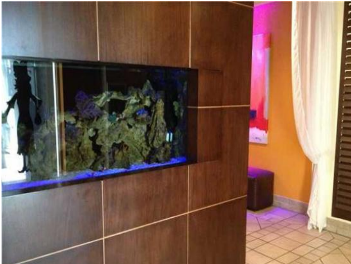
Splendid reception area