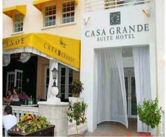
Beautiful entrance view