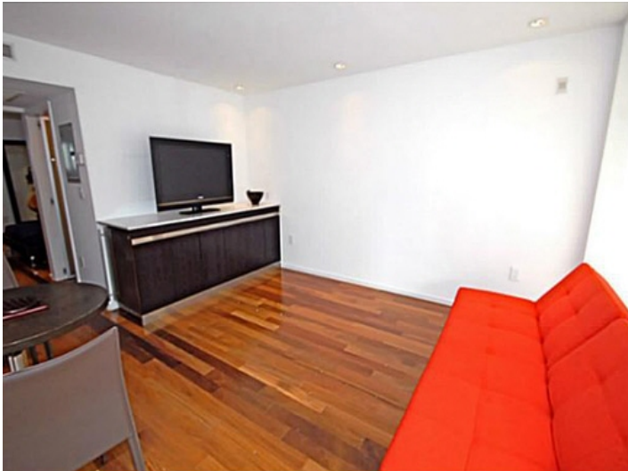
Comfortable living area with TV