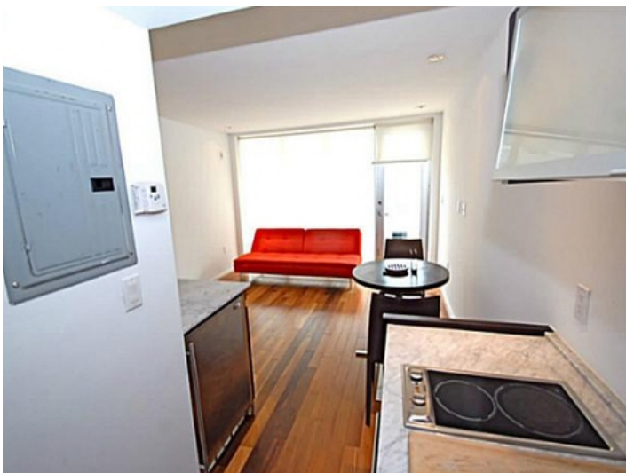
Kitchen corner view