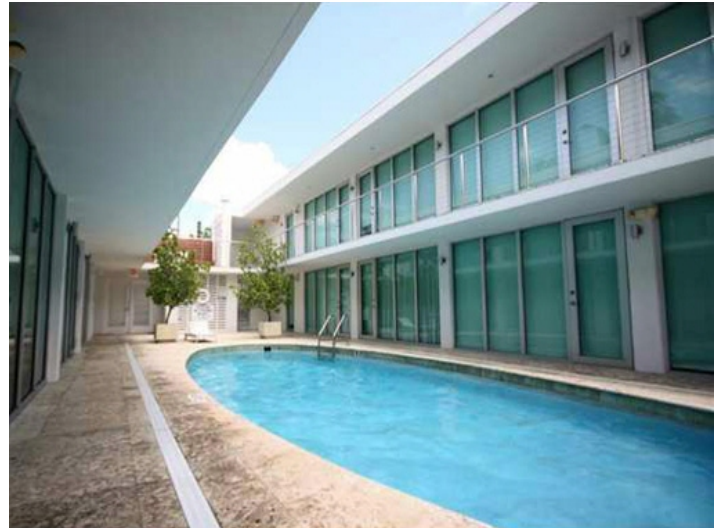
Pool area to enjoy the sunny week-ends