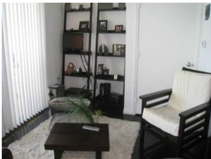
Take a drink in the restful area of the apartment