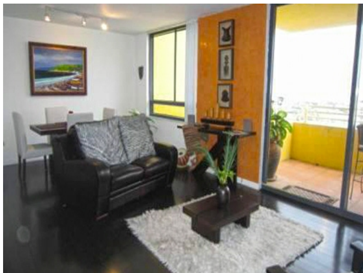
A beautiful view from the balcony to the South part of the city