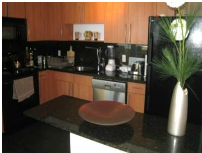
Totally renewed kitchen with its marble counter top