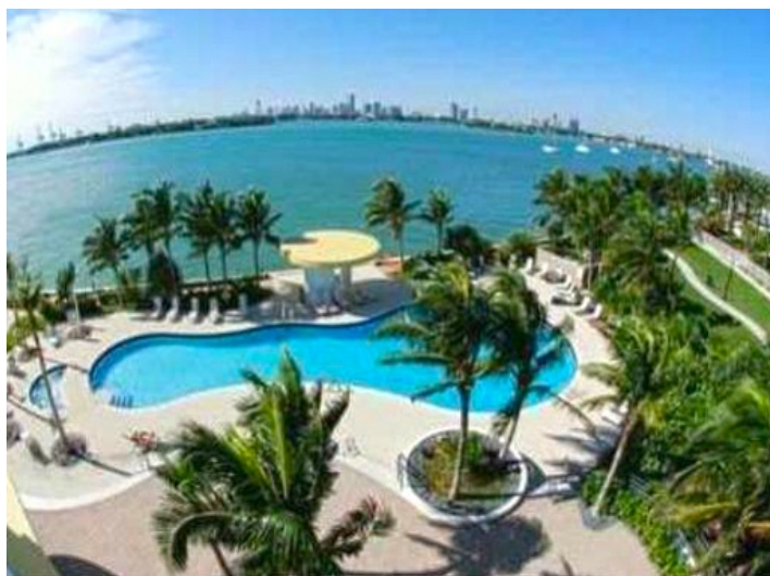
The unique and majestic view to the bay

All information is correct to the best of our knowledge. Errors and prior sale excepted. This prospectus is purely for information purposes. Only the notarized deed of sale is legally binding.