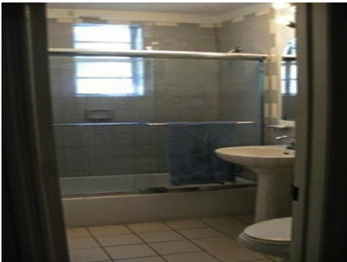
Big bathroom with a shower cubicle