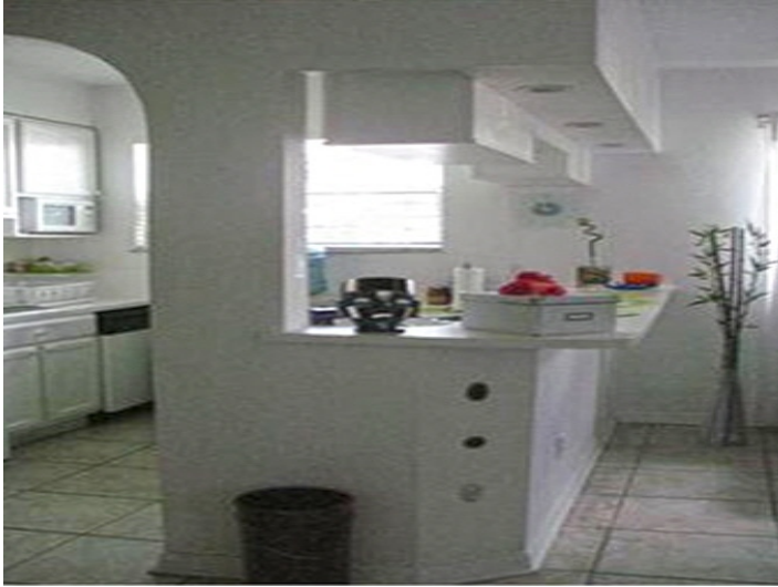
Cozy kitchen with its countertop