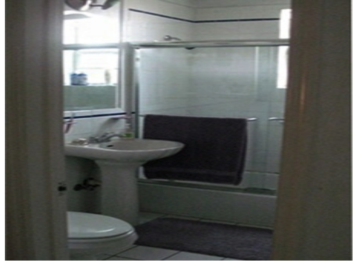
Great bathroom with toilet