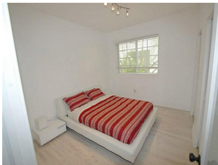
Commodious bedroom with big and comfortable bed