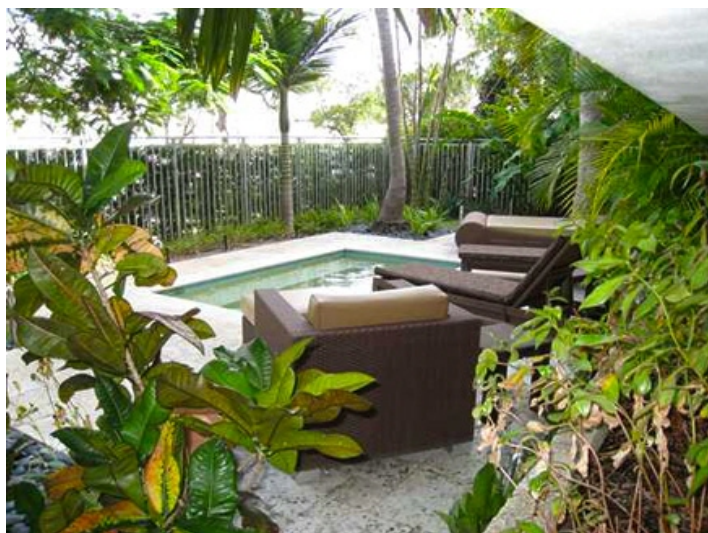
Relax time in the romantic garden

All information is correct to the best of our knowledge. Errors and prior sale excepted. This prospectus is purely for information purposes. Only the notarized deed of sale is legally binding.