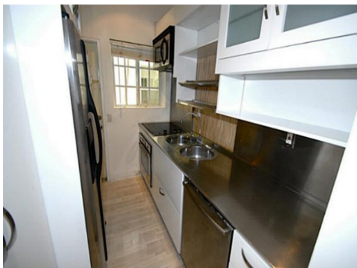
All you need kitchen with stain and steel appliances