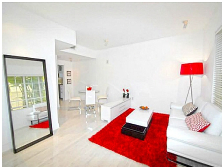
Spacious and bright living area