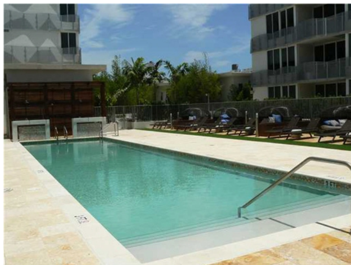
Common swimming pool with comfortable chaise longue