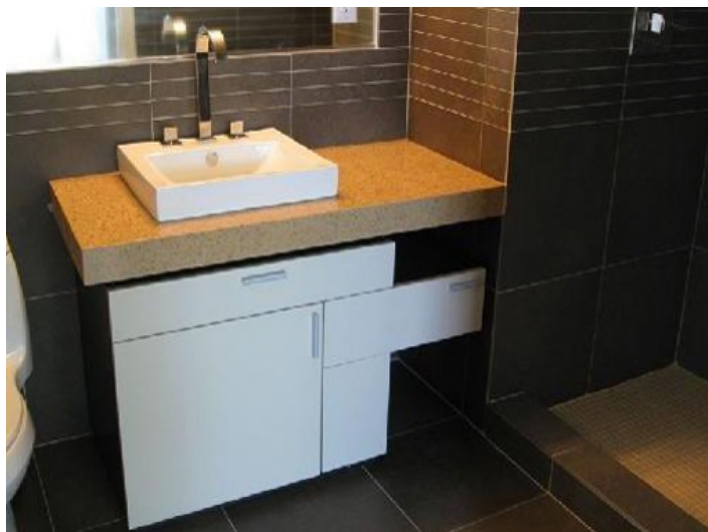
Modern style bathroom with big mirror