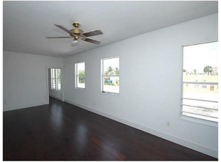
Bright living room with its wood floor