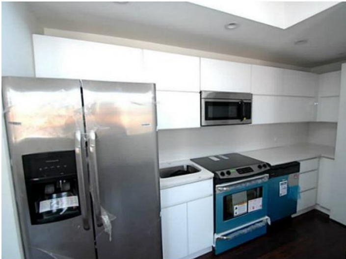
Totally renewed kitchen with stainless steel appliances