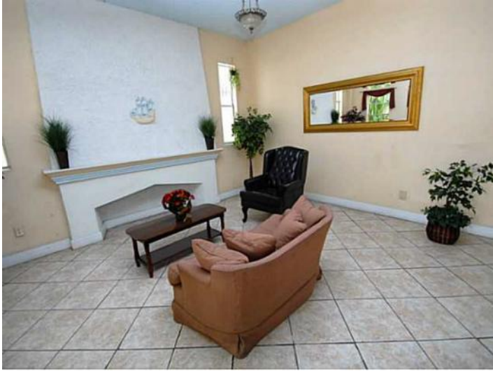
Spacious sitting room with room for your own home cinema