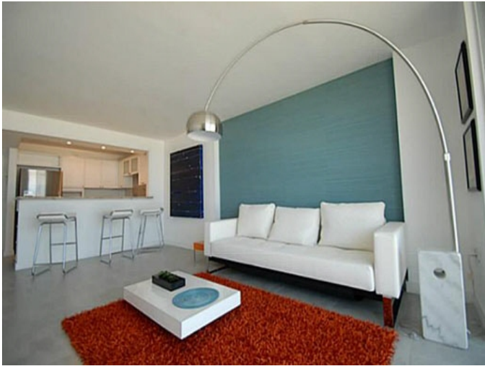
A very beautiful beach view from the open balcony