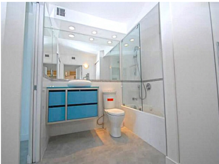
Kitchen with all new impact windows and door and brand new equipment

All information is correct to the best of our knowledge. Errors and prior sale excepted. This prospectus is purely for information purposes. Only the notarized deed of sale is legally binding.