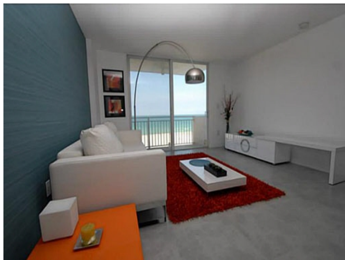
Comfortable and modern design room