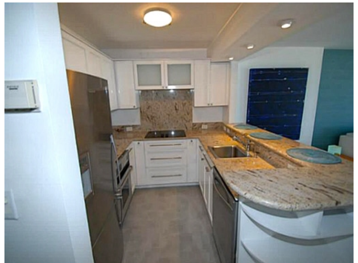
Luxurious bedroom with King Size bed