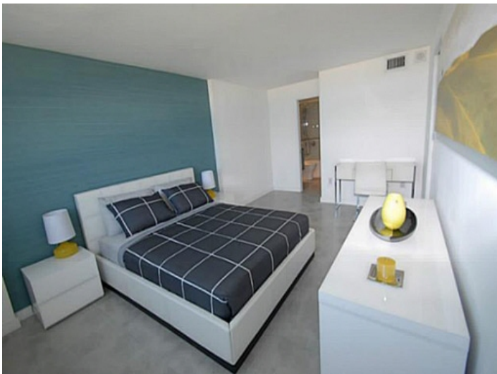
All new furnished and comfortable room