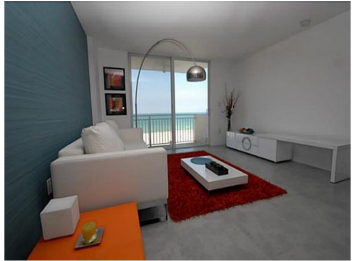
Comfortable and modern design room