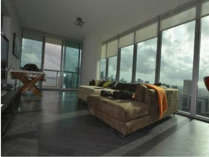
Large living room