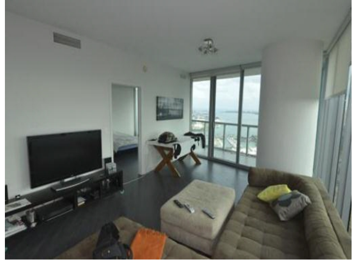
Large living room