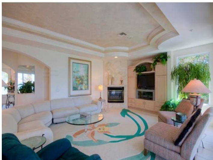
Lovely living room with fireplace