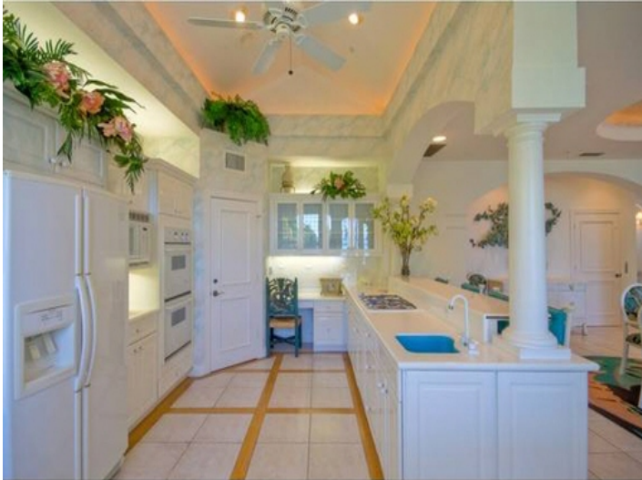
Fully equipped kitchen with breakfast bar