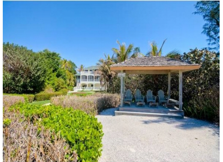
Covered terrace at the beach