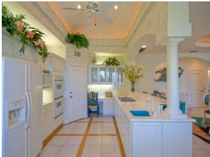
Fully equipped kitchen with breakfast bar