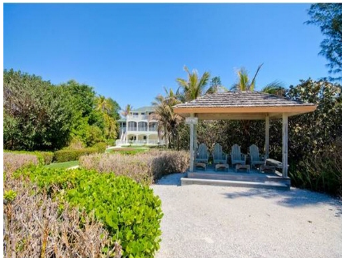
Covered terrace at the beach