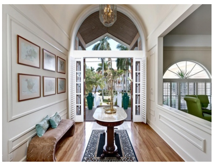
Entrance in the property