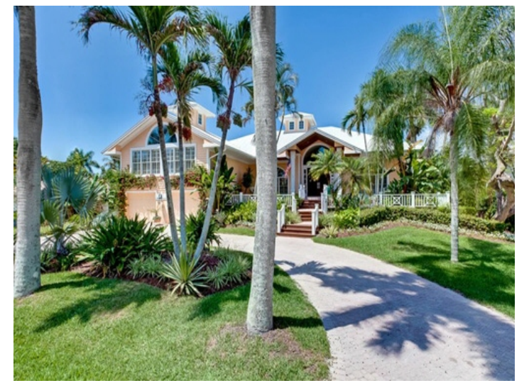
Path to the property