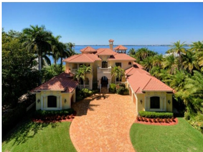
Imposing mansion in Fort Myers with jetty and dock