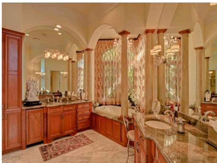
Fully equipped luxury bathroom