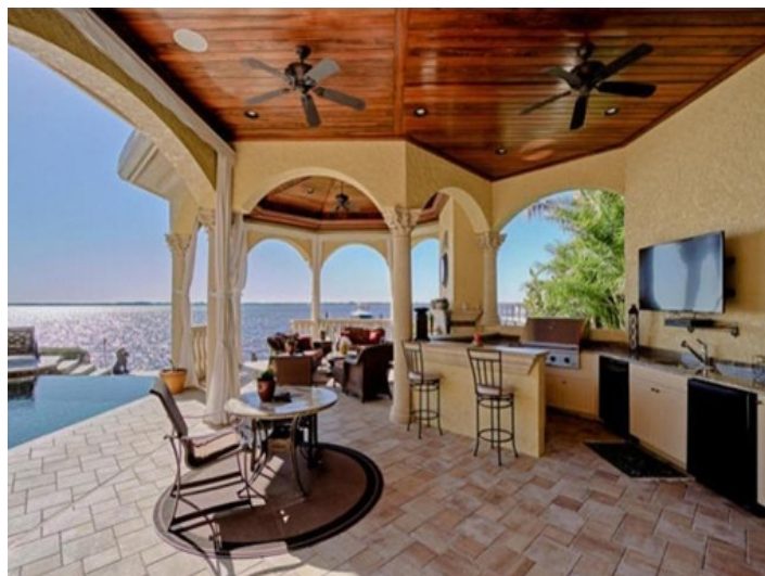
Summer kitchen with ocean view