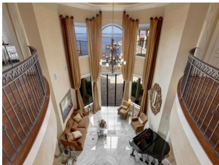
View to the ground floor with high windows