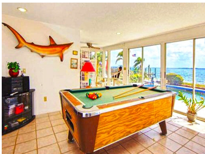
The pool table