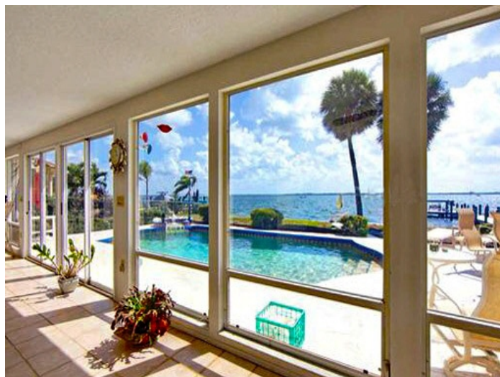
Panoramic windows overlooking the pool and the bay