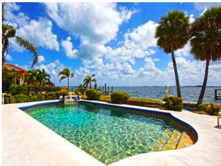
Beautiful pool overlooking the bay