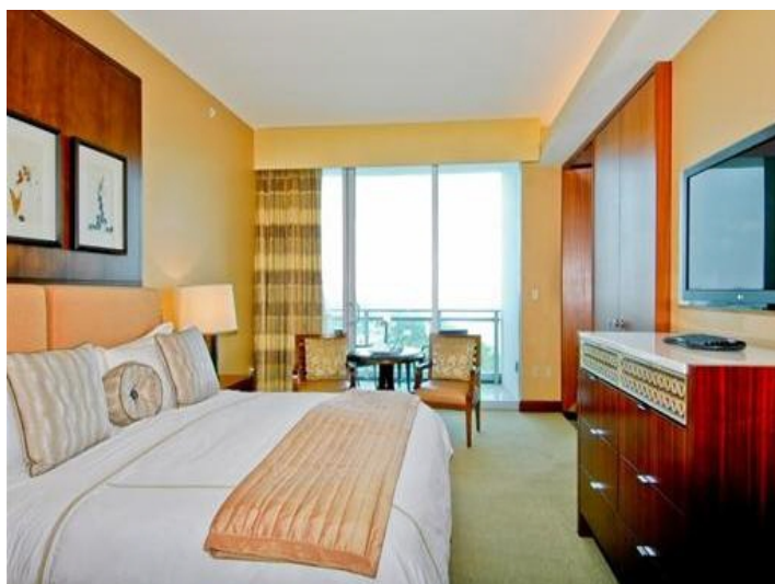
Elegant bedroom with view to the sea