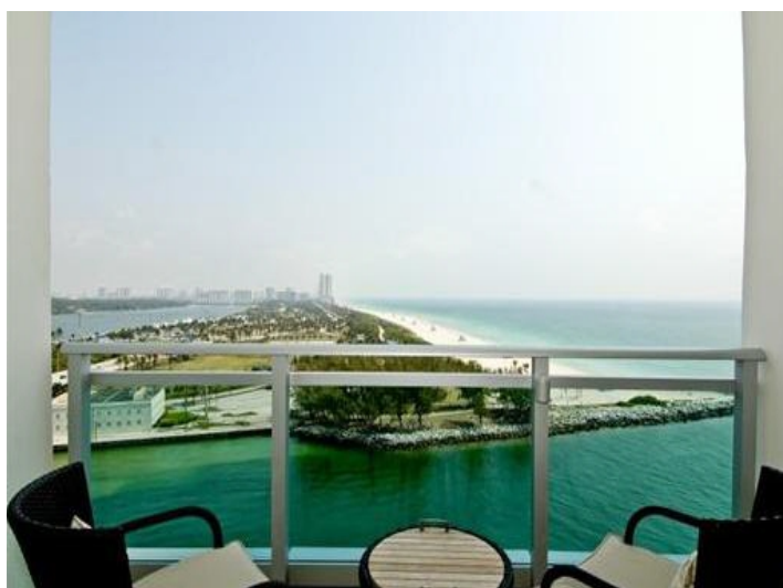
View to Bal Harbour

All information is correct to the best of our knowledge. Errors and prior sale excepted. This prospectus is purely for information purposes. Only the notarized deed of sale is legally binding.