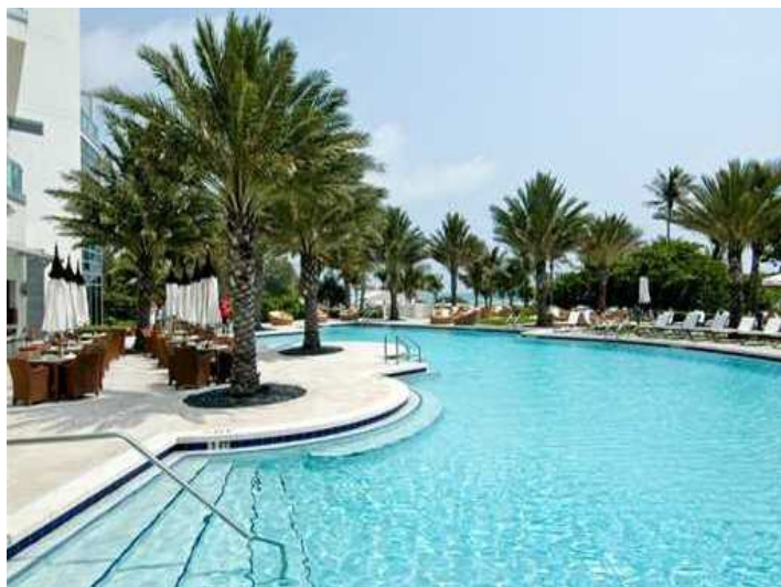
Magnificent pool in front of the skyscraper